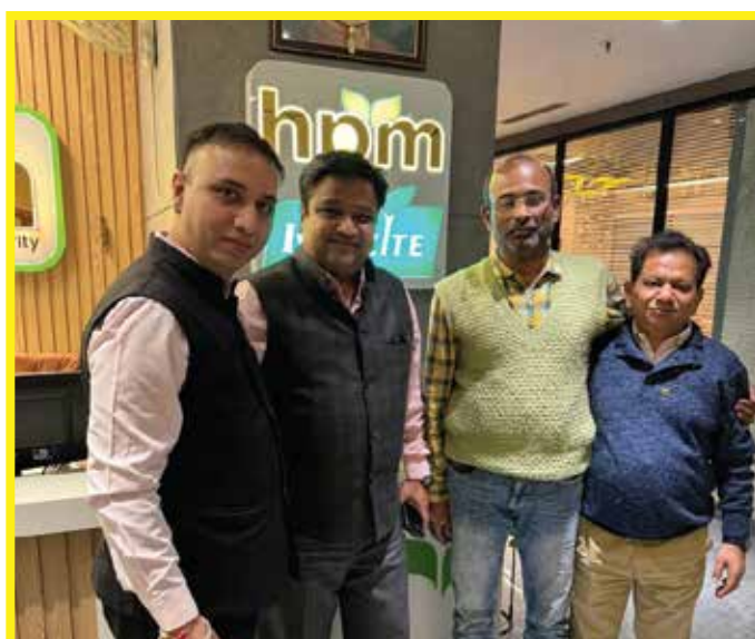
Indogulf CropSciences Ltd.