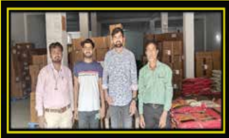
LUCKNOW DEPOT AUDIT DAY