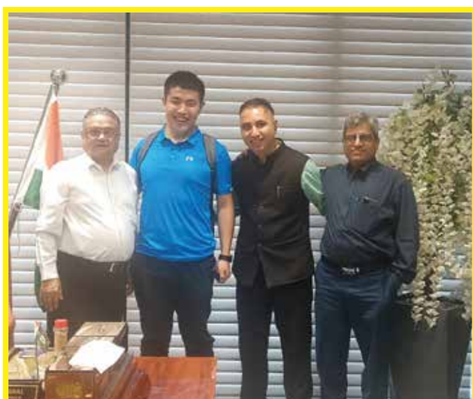
Beijing Luckystar Co. Ltd.