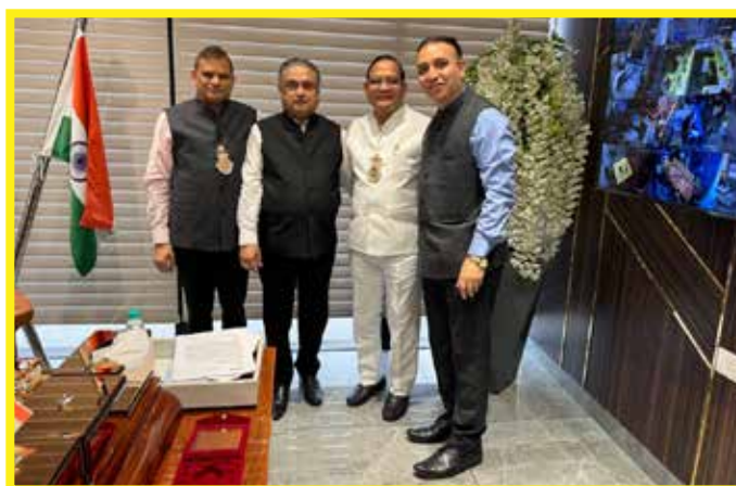
Agrico Organics Limited