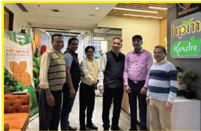
Rainbow India Pvt. Ltd.