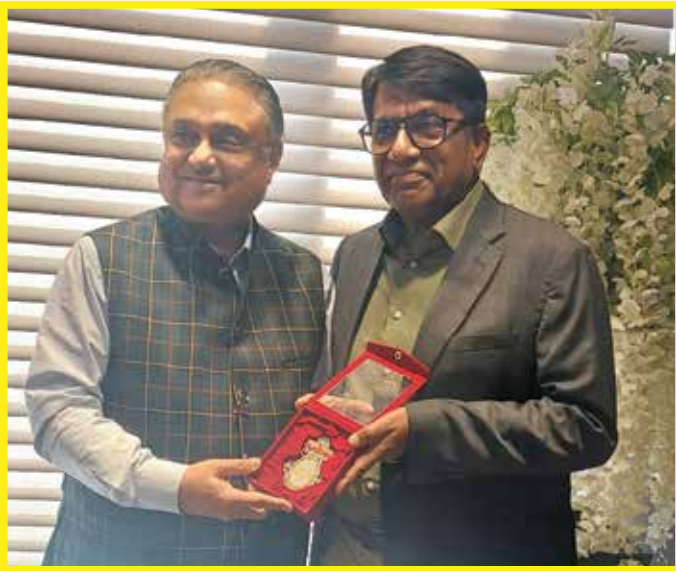
Spectrum Ethers Pvt. Ltd.