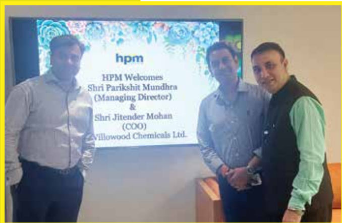
Willowood Chemical Ltd.