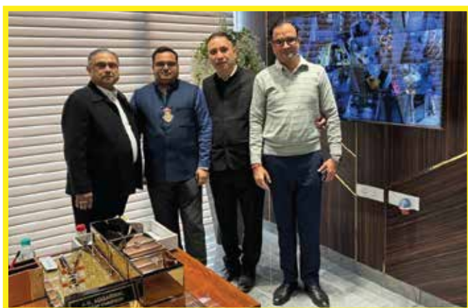
Nagarjuna Fertilizers & Chemicals