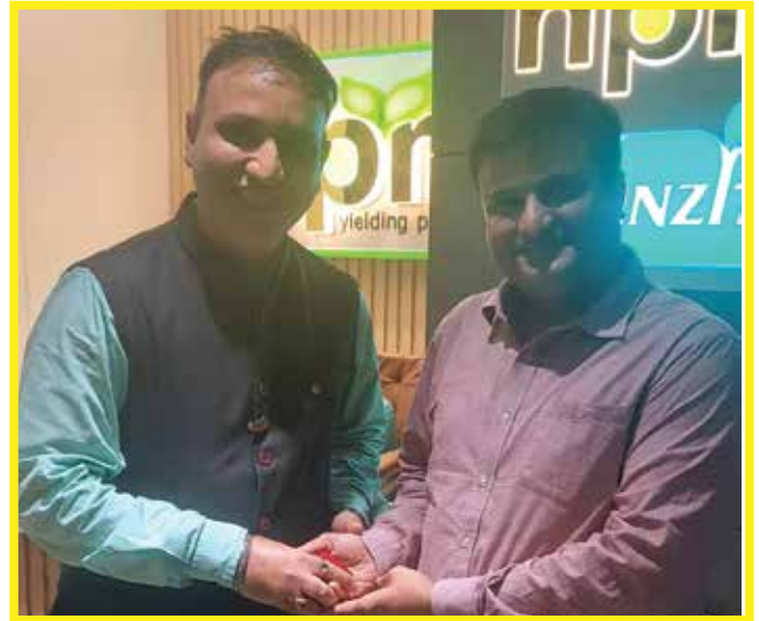
Vimal Crop Care Pvt. Ltd.