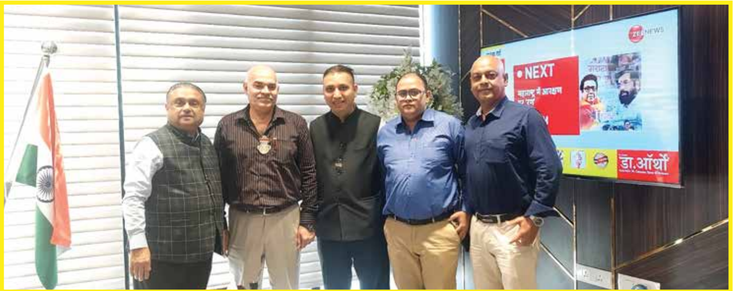
Heranba Industries Ltd.